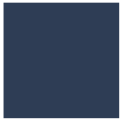
Bases (2) (no cutting required)