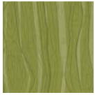
A, C, D, and F