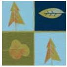
B, E, and journaling piece (back)