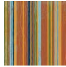
B, E, and H